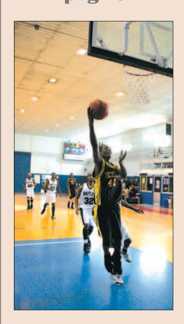
Cougars battle Wildcats