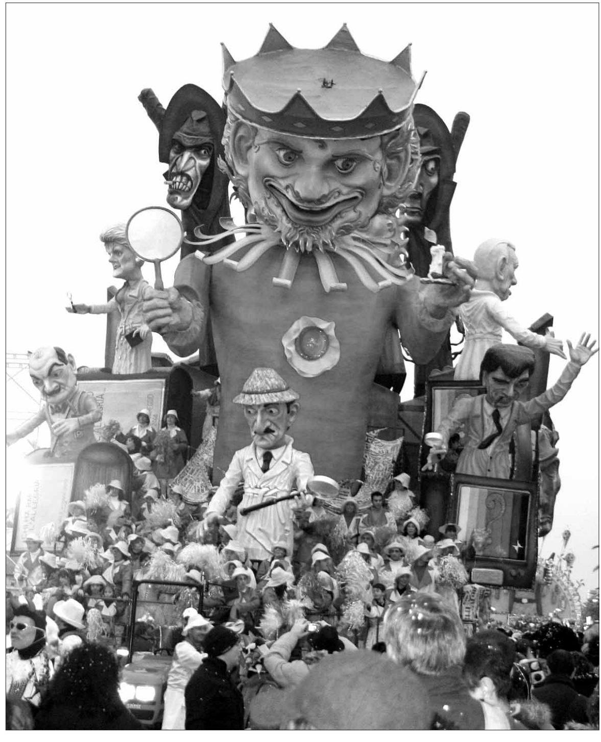
"Who has kidnapped our cheerfulness?" by Luciano Tomei is set on the background of a weird town, made up with newspapers and TV sets. There are four sinister-looking individuals that represent the daily bad news and five famous investigators of the fantasy world: Mrs.Fletcher, Poirot, Clouseau, Colombo and Derrick. The float represents the investigation in order to find the "kidnapped" cheerfulness again. If you are staying in the area, stay at the Sea Pines on Camp Darby.

Asiago - firework display with be held Jan. 30 and 31 is reckoned music for a duration of 25 minutes to be one of the most important at the town's airport 'R. Sartori,' Feb. 1-3 with a start time each day of 9